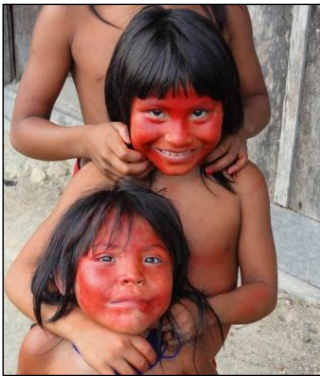
Unknown to the world, these Waiapi children are known by God.

Reaching the Least Known - We are thrilled to have a role in reaching people groups that most of the world has never heard of. In 2012, we completed translations of The HOPE for the Kanayatn People of Indonesia, the Triqui Indians of Mexico and the Waiapi Tribe of Brazil (who number only about 2,000).