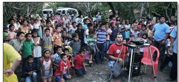
Children eagerly await the movie that has come to their village.

men, women and children made a first time decision to follow Christ and 909 asked to be disciplined.