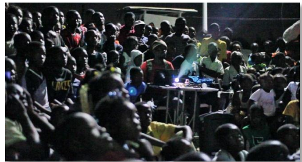
The Mars Hill team will not forget those in Haiti who stood motionless watching The HOPE in their language.

From God's Heart to Their Heart - In January, a Mars Hill team took The Creole HOPE to Haiti and witnessed how important it is for people to see and hear the Gospel in their primary tongue; their heart language. This kind of divine exchange is now being repeated often in Haiti and around the world. The HOPE is currently in 50 languages, with over 40 new translation projects in process.