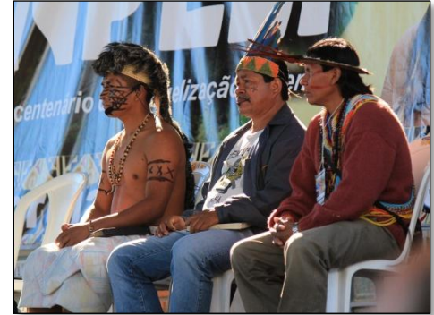
Tribal leaders are willing to risk their lives to take the Gospel to unreached tribes. We are blessed to equip them with The HOPE.

HOPE on the Amazon - Authorities are increasingly barring missionary activity in the Amazon Basin. However, God is raising up Christian tribal leaders who are burdened to reach the remaining unreached tribes of that area with the Gospel. But they need tools. This year, in partnership with the Vernacular Media Services (of Wycliffe/SIL) and Renew Outreach, we completed The HOPE in Portuguese, the trade language of the Amazon and the gateway language for translation work in hundreds of tribal languages. Already indigenous tribal missionaries are taking The HOPE on solar powered projection systems to remote tribes. The HOPE is often translated in person as it is shown. Plans are now being laid to produce new tribal translations of The HOPE.