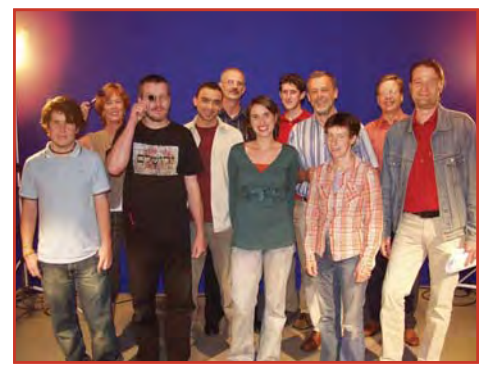
The ERF production team sends you greetings from Germany.

As one might expect, the German HOPE project was very efficient. Our lead partner for this project is a ministry called Evangeliums-Rundfunk. ERF has been sharing the Gospel with German speakers for over 45 years. With a staff of nearly 180 people, ERF is getting the Word out 24/7 via television, radio, and the Internet.