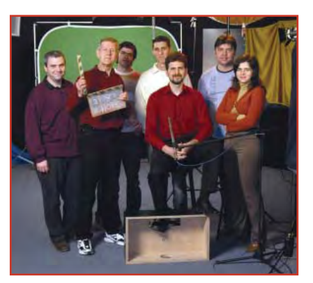
On set - the Romanian Team sends greetings.

In December 1989, thousands of people in Timisoara, Romania gathered for a public demonstration that was incited