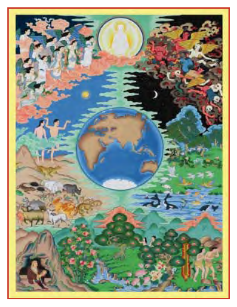
A Thangka illustrating the first 6 Biblical events shown in The HOPE - creation through the fall.

story of the world. To illustrate the story in this book (the Bible), the teacher uses a form of Tibetan story-telling artwork called a Thangka. The Thangkas in this story were created especially to parallel The HOPE.