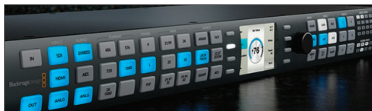
One of our new tools, the Teranex, will help us convert The HOPE video from Standard-definition to High-definition.

Finally, we plan to produce two special edition versions of The HOPE, an abridged version (under an hour) for use in Church services and classroom settings, and an indigenous tribal version that will replace current visuals to which people in remote areas of the world cannot relate. We believe this effort will result in an even more effective tool to reach nations with the Gospel!