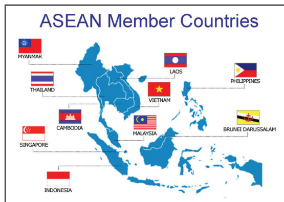
ASEAN - Brunei, Cambodia, Indonesia, Laos, Malaysia, Myanmar, the Philippines, Singapore, Thailand & Vietnam

The ESL HOPE is now in its 7th year of distribution and we are as excited about it as ever. By the end of 2015, 10 Asian countries are due to finalize the Association of Southeast Asian Nations. ASEAN will function much like the European Union. With over 630 million people, the official trade language of ASEAN will be