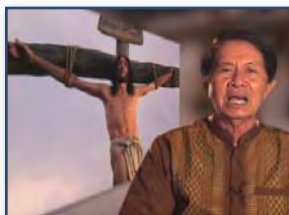
Cambodian Storyteller in traditional dress

Khmer is the main language of Cambodia. It is spoken by about 12 million people, 95% of whom are Buddhists. The missionary who