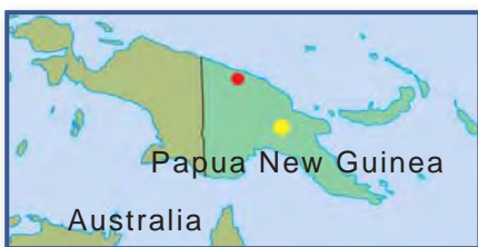
The Urim People represented by the red dot and the Kamano-Kafe by the yellow

About 100 miles north of Australia, Papua New Guinea (PNG) occupies the eastern half of the Island of New Guinea and numerous smaller islands. With a land mass about the size of Sweden, PNG has more languages than any other country; over 820 indigenous languages making up twelve percent of the world's total. The HOPE is now in two of those languages. Kamano-Kafe is spoken by about 80,000 people and Urim is spoken by about 5,000 people.