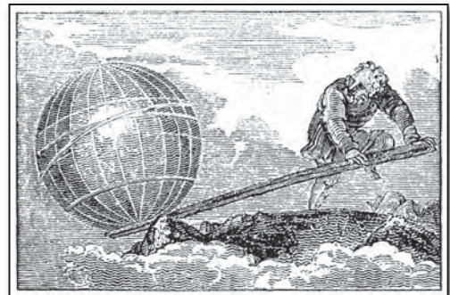
Engraving from an 1824 Mechanics Magazine illustrating the law of the lever

This has all happened with a full-time staff of four, a handful of part-timers, a committed board, a small but faithful community of supporters and intercessors . . . and the worldwide Body of Christ.