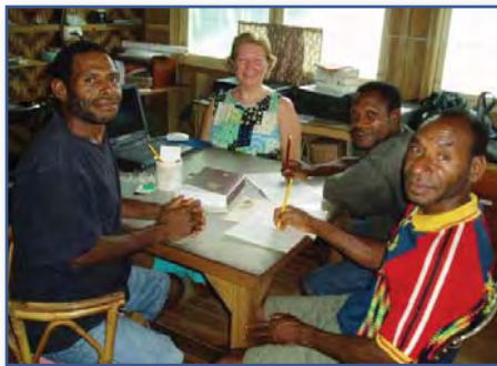
A VMS translator and her PNG team.

Both of these versions of The HOPE resulted from a partnership with the Vernacular Media Specialists (VMS), a division of JAARS which is the technical arm of Wycliffe Bible Translators. Both Mars Hill and VMS are hoping that this partnership will yield many translations of The HOPE for indigenous language groups such as those in PNG. Being that most of the more than 6,000 unreached and least reached people groups on the Joshua Project list are indigenous