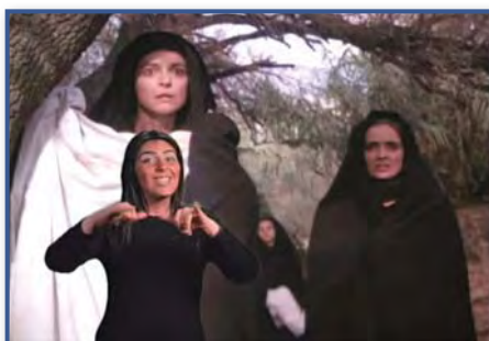
Uruguayan Storyteller signing in front of the women at the tomb, "Just as He promised, Jesus has risen from the dead!"

Last year, the IMB Media Center for the Americas came to us with the idea of producing a sign language version of The HOPE for deaf people in Uruguay. We were amazed to learn about the need, not only in Uruguay, but around the world. According to the Ethnologue, there are today over 100 sign languages in the world used by more than 300 million deaf people.