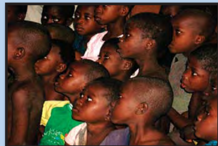
Children in Ghana watching The HOPE

There are 6,912 living languages in the world today. The whole Bible is available in 438 languages; the New Testament is in 1,168 languages. If the Bible could be made available in every language, 60-70% of the people in the world would not or could not use it to learn about God. These people are oral communicators. Approximately one billion are illiterate, the remainder are functionally illiterate. Some do not even have a written language.