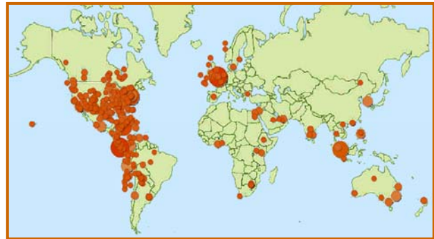
The dots represent the locations of visitors to the English and Spanish HOPE websites on a typical day.

On March 17 the Spanish HOPE website was launched making The HOPE accessible to the third largest language population on the Internet. The work that was done on the Spanish HOPE site has resulted in a template that will make it easier to add new languages to The HOPE Internet ministry. You can visit the new Spanish HOPE website at www.proyectolaesperanza.com .