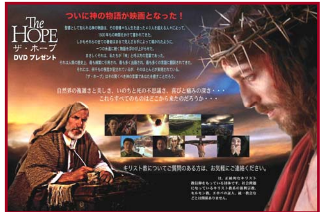
The front of the postcard used in Japan last summer.

I hope that you are blessed by this story, and by the other stories I have shared. One thing is certain, The HOPE is much bigger than any one person or any one group of people. These things would not be possible without the prayers and support of people such as you. The HOPE is truly a story of God working through the body of Christ. And what a privilege it is to join Him in that work!