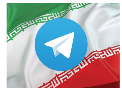
HOPE from the heavens via Satellite Television, and on the ground via a secure Web-based App!

Every month, SAT-7 Media broadcasts The Farsi, Arabic, and Turkish HOPE across the Arab-speaking world via satellite TV. In the Persian Gulf and parts of North Africa, SAT-7 uses the Telegram app as their primary audience relation tool to engage with millions of Muslim viewers. Because Telegram users are not able to see or interact with other users, the app is a safe and secure way for seekers to reach out with questions about programing they have seen. SAT-7 recently approached Mars Hill requesting clips of The HOPE to use for a daily Bible study within the Telegram app. This project, coming soon, will share The HOPE with as many as 80,000 people who currently engage with SAT-7 via Telegram.