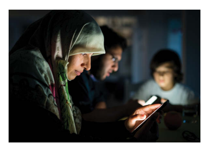
In security sensitive areas downloads of The HOPE are shared in the underground Church.

In May, the Southern Baptist's International Mission Board, together with another one of our ministry partners, built a website to covertly share the Gospel with M***** seekers in ****. This secure website was promoted in a variety of security sensitive ways, not the least of which was word of mouth in the underground Church. The site was only up for 30 days to keep its originators from being tracked.