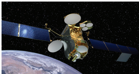
HOPE from above knows no bounds!