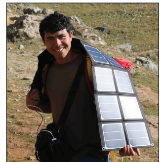
Missionary charging up the projector on the way to a showing in the next village

Some places are politically isolated. People must break the law to share and receive the Gospel, often at great personal risk. In places like this, on Micro SD cards, The HOPE can be shared discreetly, copied and distributed widely through the underground Church. Hundreds of thousands of copies of The HOPE have been disseminated this way.