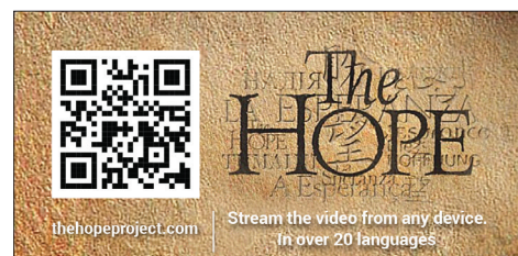
Card with QR code to The HOPE