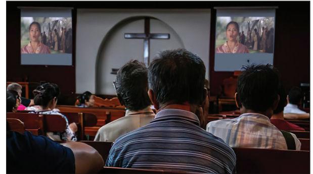
Scene from the premier of The Laotian HOPE while a memorial service was taking place on the floor below.

Our partners in ministry, School to the Nations (see story below), picked up the project and saw it through to completion. In the spring of 2019, Christian leaders from across Laos were invited to a premier screening at a Church in Savannakhet, Laos. When it became apparent that local authorities intended to raid the event with the likelihood of harassing and possibly arresting attendees, the premier was called off. But as He often does, God had another plan.