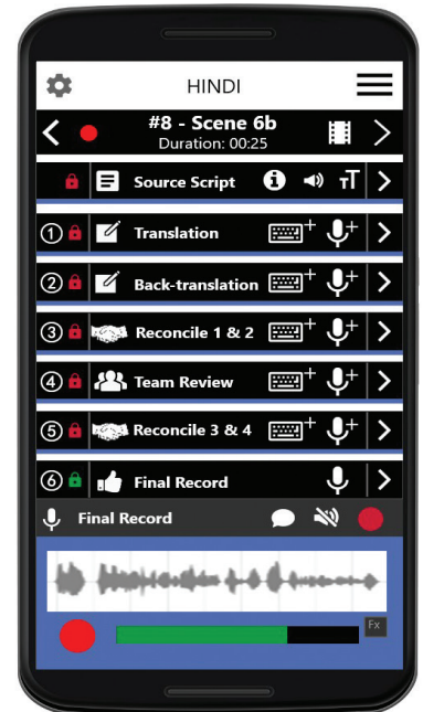
The App will use steps in the best practices of Bible translation to lead users in creating a version of The HOPE in their own language.

There are thousands of unreached people groups with no Bible or Bible-based materials in their language. This software will make it possible for them to get God’s redemptive story from creation through Christ via The HOPE in their own language, in a relatively short amount of time.