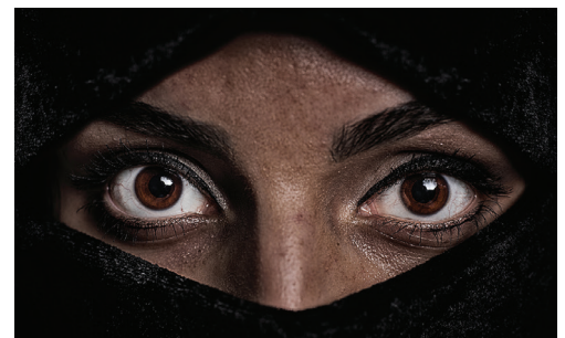
Many of those who benefit from The HOPE are in closed access countries where ministry is security sensitive. Conventional metrics are difficult to collect.

When a missionary or mission organization comes to us asking for a version of The HOPE for their language group, they are typically willing to invest their own time and money to help produce it. When a ministry wants to distribute thousands of Micro SD cards to the underground Church in a closed access country, they are willing to fund it. When a satellite broadcast ministry wants to use their airtime to broadcast The HOPE, they are willing to cover their costs. This is good user buy-in. As these kinds of opportunities continue to be initiated by those a) who are the closest to the field of mission opportunity, and b) who are willing to do whatever it takes to acquire and utilize the tool, then we are confident it is having an impact.