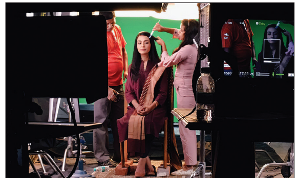
Our production team in India on set . . . some of the most talented and committed people we’ve ever known.

While we believe that much ministry will result directly from the use of The HOPE in the major languages of India, we also know that these languages are the gateway languages for hundreds of tribal languages in India. With the growing influence of Hindu nationalism in India, the persecution of Christians in India is increasing. The time to act is now. We plan to put these major languages into our “HOPE in a Box” software application so that Christian workers on the ground in India can quickly translate The HOPE into tribal languages. Please pray for our work in India!