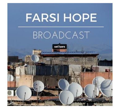
In closed access countries that are ripe for harvest, the Gospel is going forth!

There are some 7,000 Haitians stuck in Tijuana with hopes of getting into the U.S. Many of them had been contracted to work in Brazil for the Olympics and then forced to move on. One of our ministry partners is