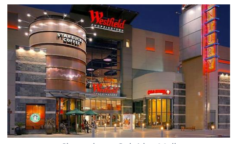
Shown here, Oakridge Mall. Ministry in the Mall, what a great idea!

• March 18-19 / Oakridge Mall, San Jose, Ca. / God Talk in the Mall Some of our ministry partners have been involved in a strategy this spring called "God Talk in the Mall." They had 300 HOPE DVDs (English and Spanish) on hand to give to people who were interested to know more. Here's what they reported after one of their weekends, "We had a grace-filled weekend at the God Talk. We had 67 people stop at the kiosk and take our survey; 39 of the 67 wanted follow up! We are not sure exactly how many DVDs were handed out, as we had 45 volunteers on two-hour shifts all day Saturday and Sunday, with four people per shift."