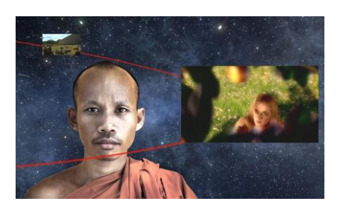
A frame from the section explaining the need for the "big picture"; the "scarlet thread."

You may have heard the saying, "the cobbler's children have no shoes." Mars Hill is a media ministry, but for far too long we've gone without a video to explain why The HOPE is such a strategic Great Commission media tool for reaching the unreached. This soon to be released, 3:30-minute video will explain what an unreached people group is, why it is so important to reach them, and how The HOPE overcomes four obstacles to do just that! We are putting a great deal of time and effort into this, believing it will further the ministry of The HOPE and thus help complete the Great Commission!