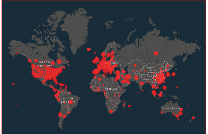
Map # 1 - You may be familiar with this map if you've watched the news in recent weeks. It shows the spread of COVID-19. This image was captured on April 4, 2020.

Each map below depicts our world in the past week, (March 20 - April 4.) It is the same world, viewed from two dramatically different perspectives.