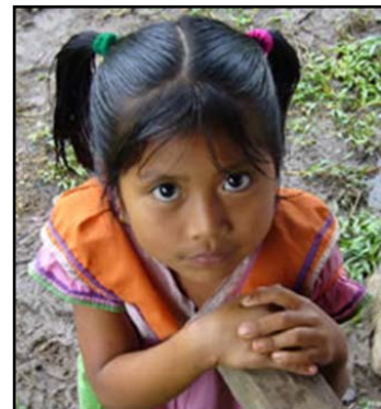
A Ngäbe child in traditional brightly colored clothing – God knows no limits to reach a little one like this.

There are more stories, but I am running out of space. I think you get the idea . . . God is doing great things! Thank you for your interest in this ministry. We are facing great opportunities and challenges. The support we receive from people such as yourself is what God uses to make this work possible. Please do not hesitate to contact us with any questions or comments.