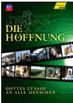
The front cover of the German version of The HOPE - 1 of 6 languages to be broadcast

God gets the Glory as The HOPE gets Some Press - In an August radio interview, I was blessed to share what God is doing around the world with The HOPE. The 2-part interview aired on 26 stations in the KHCBC radio network. Also in August, The HOPE was highlighted in the premier issue of a new missions magazine that went out to thousands of Churches in and around Texas. It ran the amazing story of how God orchestrated the ministry of The HOPE in Haiti. To view the article, go to http://mydigimag.rrd.com/publication/?i=43337 . (Pg.10-11)